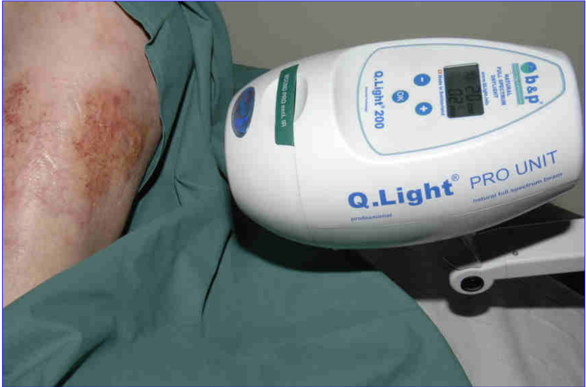
Dept of Plastic & Reconstructive Surgery / UZGent