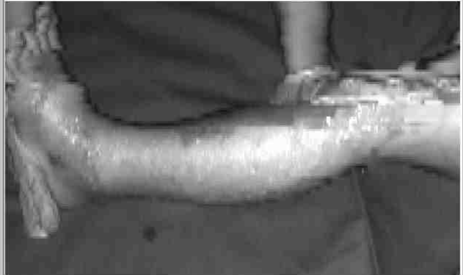
LD Photo Image